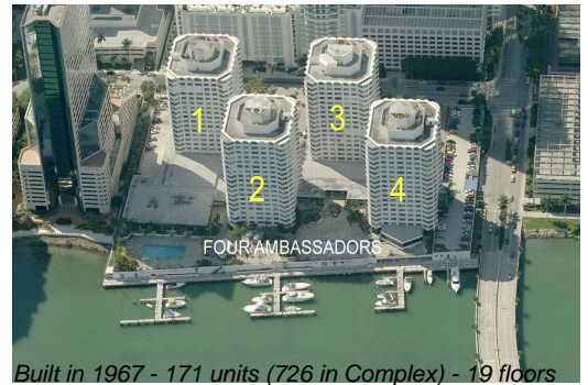
Built in 1967 - 171 units (726 in Complex) - 19 floors

Four Ambassadors Association INC Homeowners association (305) 374-6270