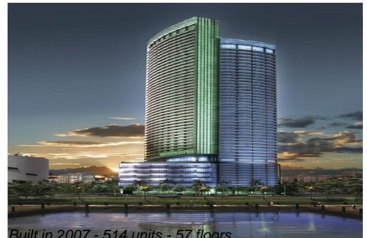
Built in 2007 - 514 units - 57 floors