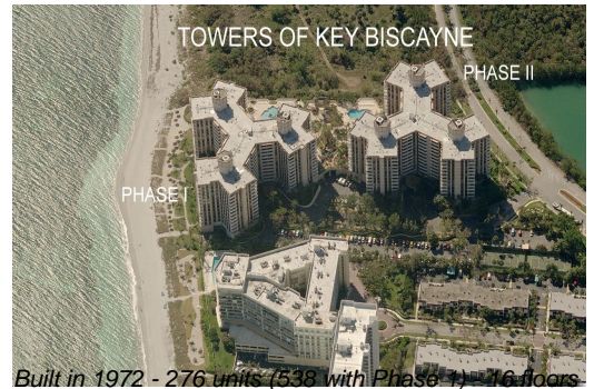
Built in 1972 - 276 units (536 with Phase I) - 46 floors