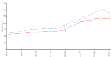
Ventura at Malibu Bay vs Homestead