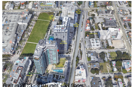
Built in 2013 - 410 units - 38 floors