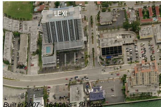
Built in 2007 - 164 units - 19 floors