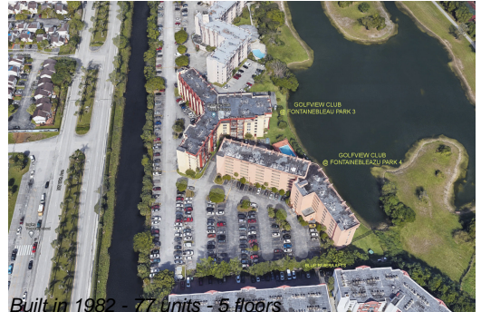
Built in 1982 - 77 units - 5 floors