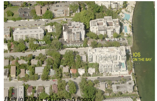
Built in 2008 - 43 units - 5 floors