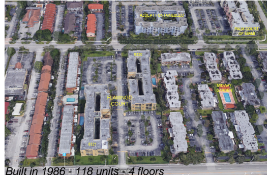
Built in 1986 - 118 units - 4 floors