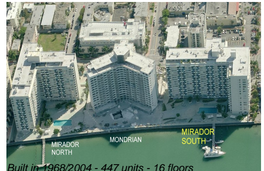
Built in 1968/2004 - 447 units - 16 floors