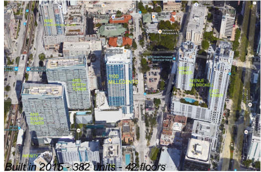
Built in 2015 - 382 units - 42 floors