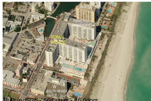
Built in 1926 - 564 units - 16 floors