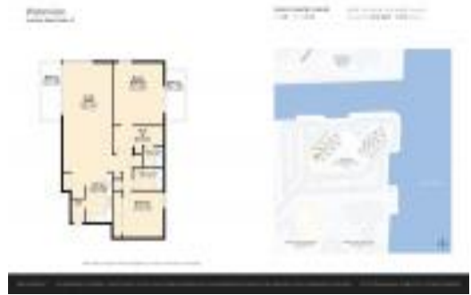
Built in 1981 - 394 units - 23 floors

The above valuated price is a baseline figure that does not take into account any specific renovation, upgrade, split, merge, or deterioration of the unit.