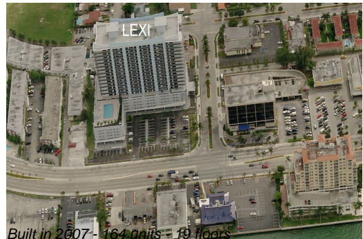
Built in 2007 - 164 units - 19 floors