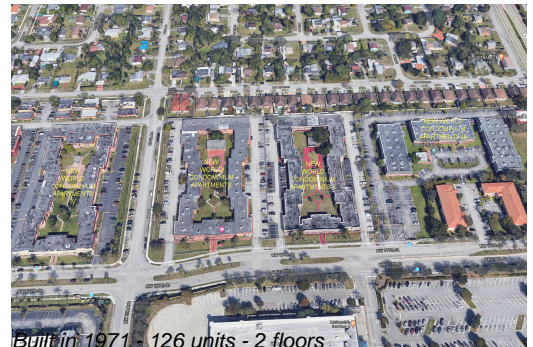
Built in 1971 - 126 units - 2 floors