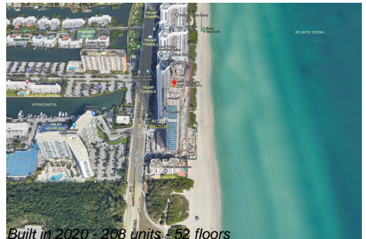
Built in 2020 - 208 units - 52 floors