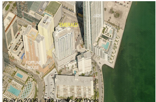
Built in 2006 - 142 units - 27 floors