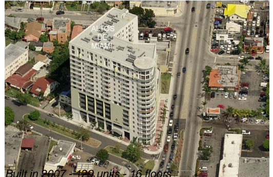
Built in 2007 - 129 units - 16 floors