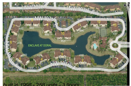
built in 1998 - 258 units - 3 floors