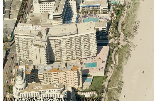
Built in 1965 - 625 units - 14 floors