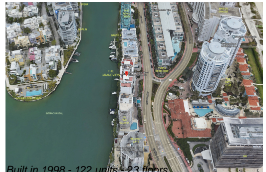
Built in 1998 - 122 units - 23 floors