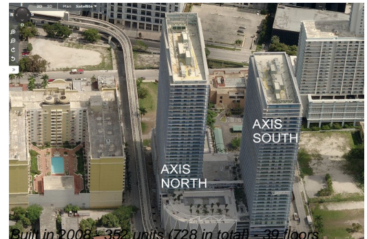
Built in 2008 - 352 units (728 in total) - 39 floors