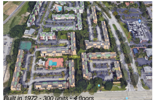
Built in 1972 - 300 units @ 4 floors