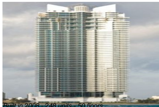
Built in 2008 - 248 units - 50 floors