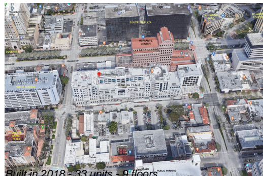
Built in 2018 - 33 units - 9 floors