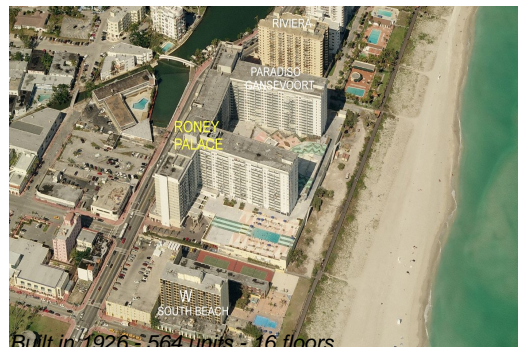
Built in 1926 - 564 units - 16 floors