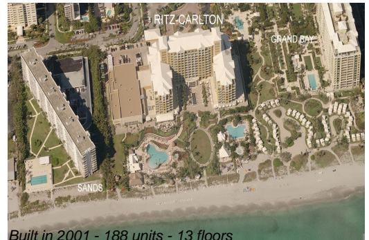
Built in 2001 - 188 units - 13 floors