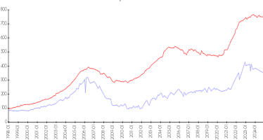
Plaza of the Americas 4 vs Sunny Isles