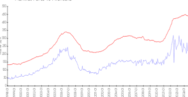
Admiral Ports vs Aventura