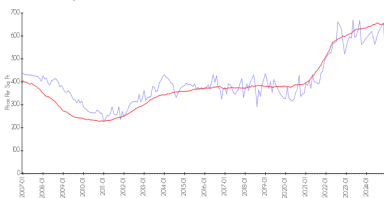
Miami vs Miami-Dade