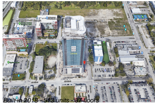
Built in 2018 - 513 units - 37 floors