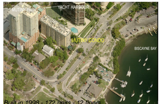
Built in 1998 - 172 units - 12 floors