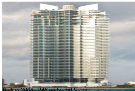
Built in 2008 - 248 units - 50 floors