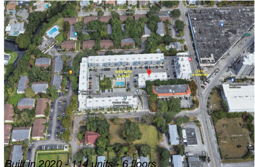
Built in 2020 - 114 units - 6 floors