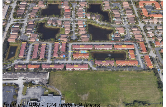
Built in 1999 - 124 units - 2 floors