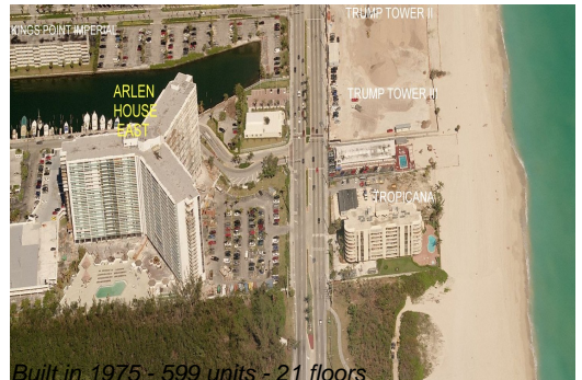
Built in 1975 - 599 units - 21 floors