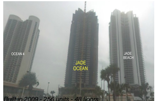
Built in 2009 - 256 units - 48 floors