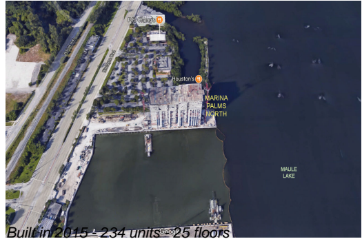
Built in 2015 - 234 units - 25 floors