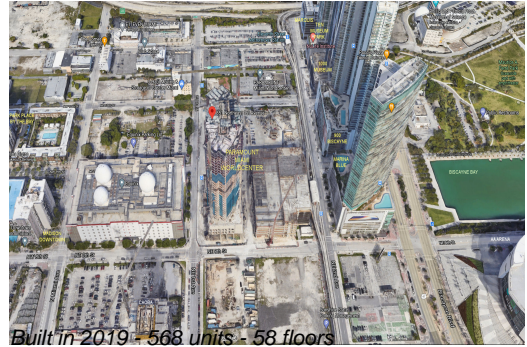
Built in 2019 - 568 units - 58 floors