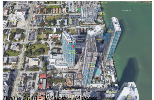
Built in 2018 - 384 units - 44 floors