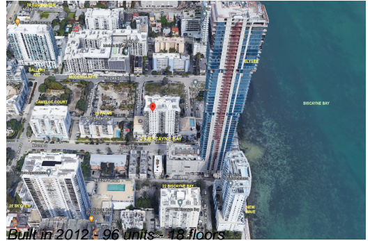
Built in 2012 - 96 units - 18 floors