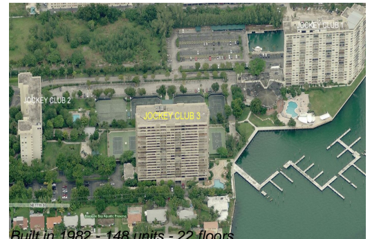
Built in 1982 - 148 units - 22 floors