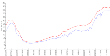
Cedar Wood Homes Condo vs Homestead