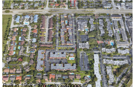
Built in 1968 - 176 units - 3 floors