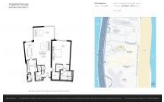
Built in 1963 - 127 units - 16 floors

The above valuated price is a baseline figure that does not take into account any specific renovation, upgrade, split, merge, or deterioration of the unit.