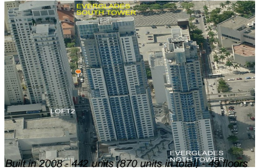
Built in 2008 - 442 units (870 units in total) - 45 floors