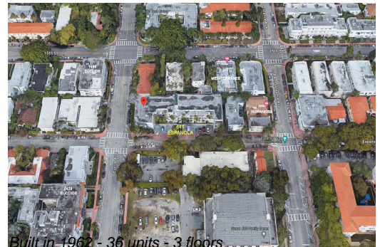
Built in 1962 - 36 units - 3 floors