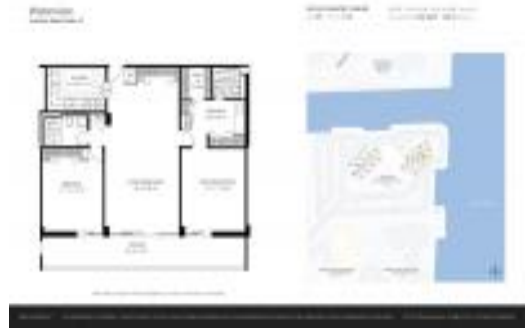
Built in 1981 - 394 units - 23 floors

MLS Number: A11643533 Status: Active Size: 1,146 Sq ft. Bedrooms: 2 Full Bathrooms: 2 Half Bathrooms: Parking Spaces: 1 Space, Additional Spaces Available, Valet Parking View: List Price: $565,000 List PPSF: $493 Valuated Price: $413,000 Valuated PPSF: $360