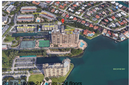
Built in 1975 - 217 units - 4 floors