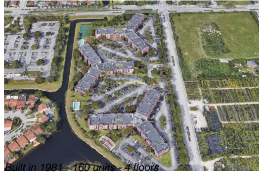
Built in 1981 - 160 units - 4 floors